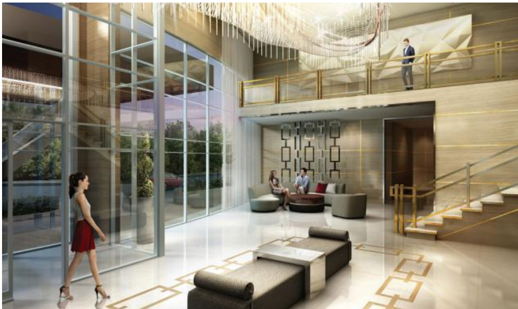
Lobby at 5959 Yonge Street Condos, image courtesy of Ghods Builders

The Kirkor Architects Planners -designed development will feature towers at heights of 31 and 43 storeys, rising from a shared podium containing 15,000 sq. ft. of retail space at the corner of Cummer Avenue, just north of Finch.