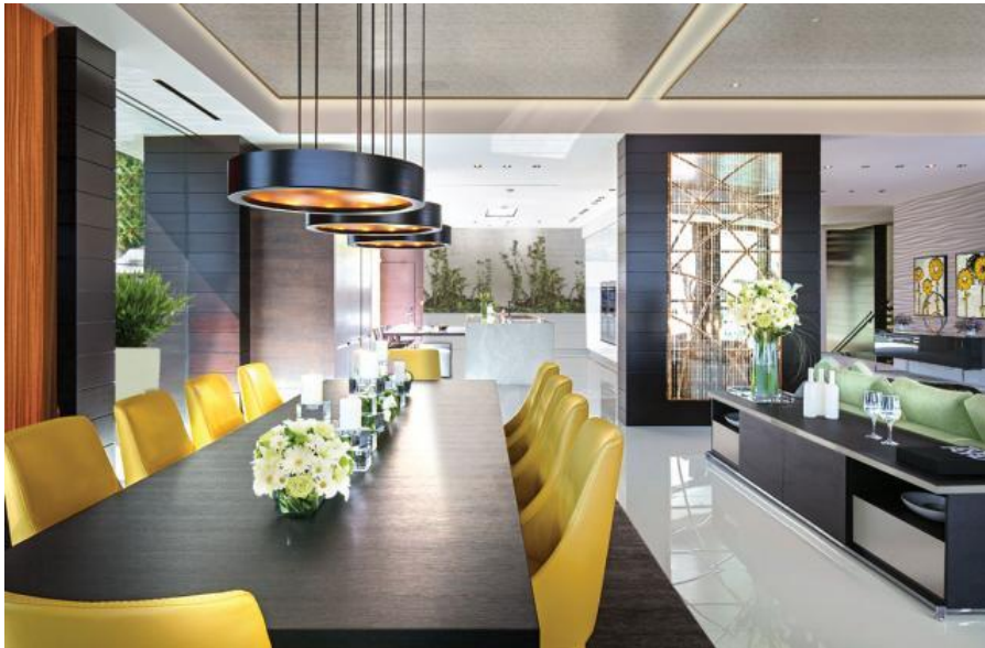
Party room at 5959 Yonge Street Condos

Here is a look at one of 5959 Yonge Street's other party room amenity spaces.