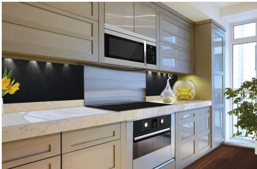
Party room at 5959 Yonge Street Condos

New images also give us a taste of the suites at 5959 Yonge, which start at $288,900, and are available in sizes ranging from 510 square feet to 750 square feet.