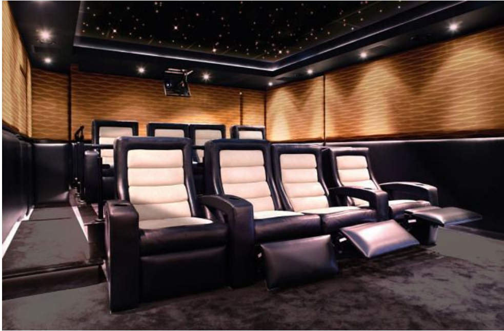
Theatre at 5959 Yonge Street Condos

The development will also include amenities aimed at keeping fit, in sports, and in relaxing. There will be a Yoga/Pilates studio, a fitness centre and an indoor pool area with adjoining rain room, wet steam room and dry sauna, and a 10-pin bowling alley. The most interesting amenity planned for 5959 Yonge Street would have to be the glass multi-sport LED fitness court featuring adjustable lines that allow the court to be used for over a dozen different sports, easily switched by the push of a button. In addition, the amenity spaces will accommodate businesses with the inclusion of a business centre, and gatherings with a sports bar and party rooms with kitchens.