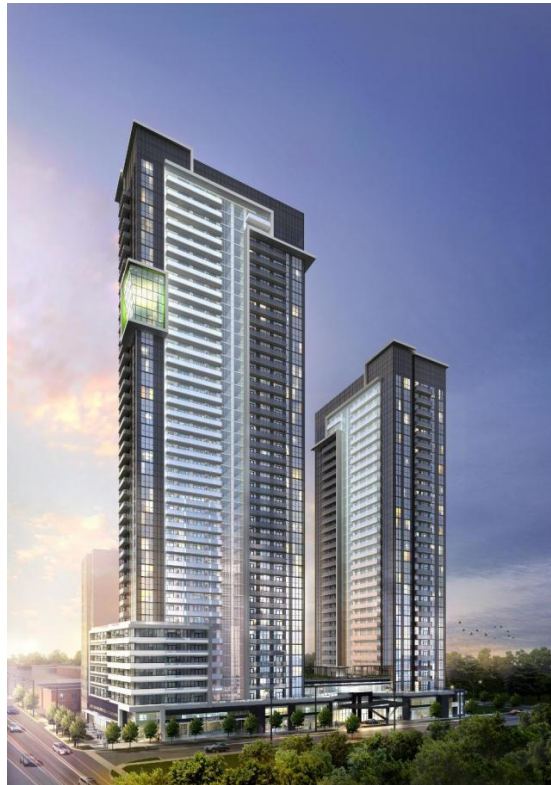
5959 Yonge Street Condos

A collection of new images are giving us a better idea of how the interior spaces will look in the two-tower 5959 Yonge Street Condos development proposed for North York by Ghods Builders Incorporated .