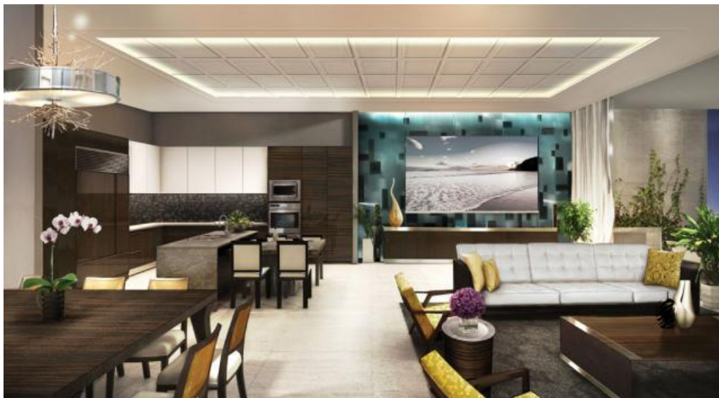
Party room at 5959 Yonge Street Condos

The development will also include amenities aimed at keeping fit, in sports, and in relaxing. There will be a Yoga/Pilates studio, a fitness centre and an indoor pool area with adjoining rain room, wet steam room and dry sauna, and a 10-pin bowling alley. The most interesting amenity planned for 5959 Yonge Street would have to be the glass multi-sport LED fitness court featuring adjustable lines that allow the court to be used for over a dozen different sports, easily switched by the push of a button. In addition, the amenity spaces will accommodate businesses with the inclusion of a business centre, and gatherings with a sports bar and party rooms with kitchens.